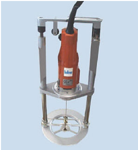
Bullmer Marking machine