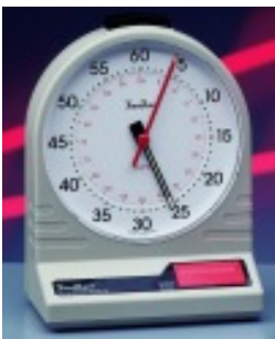
table stop clock

Special stop watch with high precision by direct stopping of a push-button, good readable LCD-display, sturdy housing (82 x 61 x 28 mm) with protection bag.