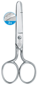
Robuso Pocket scissor