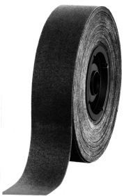
Emery Tape "Mitchell"