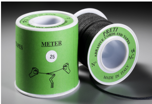
Emery Cord "Preti"